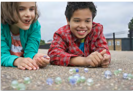
Students are introduced to popular games from Ike's childhood, like marbles.

When the final school bell of the day rings, a new day begins for K-12 students. While many are picked up by parents and shuttled home or to extra-curricular activities, many others face a large block of unstructured and unsupervised time due to working parents. Those children are at higher risk of engaging in risky behaviors and being vulnerable to predators. Those children are more likely to come from low-income families and less likely to be involved in extra-curricular enrichment activities, perpetuating their likelihood to trail substantially behind their more-affluent peers, in terms of academic achievement. 1