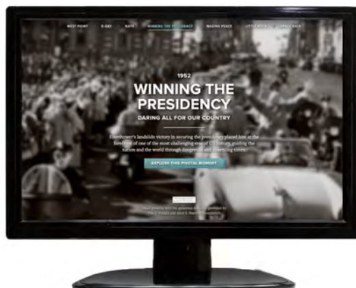
Participation in virtual IKEducation programs continues to increase significantly each year.

In addition, the gift has allowed us to engage renowned architect Gould Evans, Kansas City, to help us conceptualize the space. We look forward to sharing the concept with you when it is available.